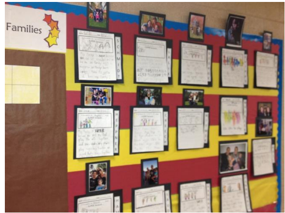
Check out these terrific writers...first grade focused on writing about their families.

To improve the team you don't study the scoreboard, you go out and practice.